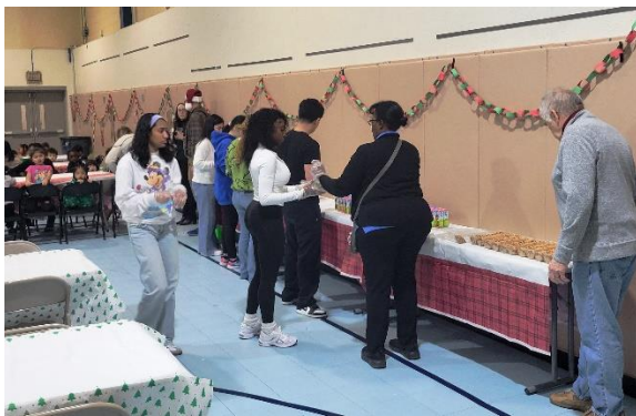
Key Club Assembly Line