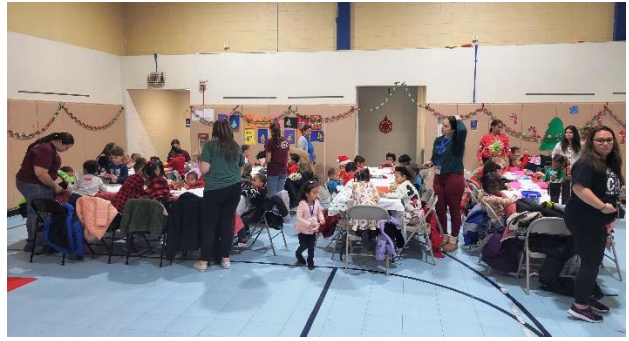
Fun in the Gym