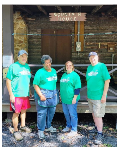
Our Day of Caring Crew