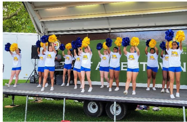
Allen HS Canary Cheerleaders