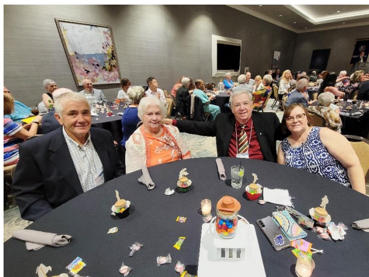
Our Table at the Banquet