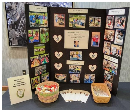
Our Display at the Convention