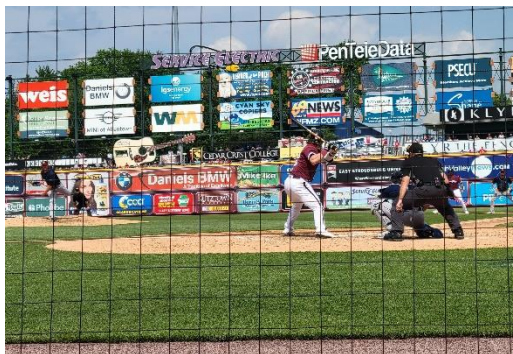
View From Dugout Suite