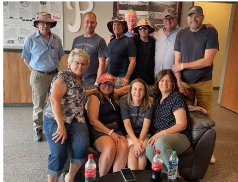
Ashcraft Clan and Friends