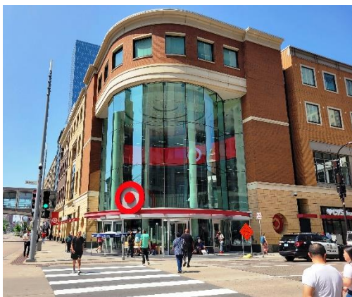
Flagship Target Store