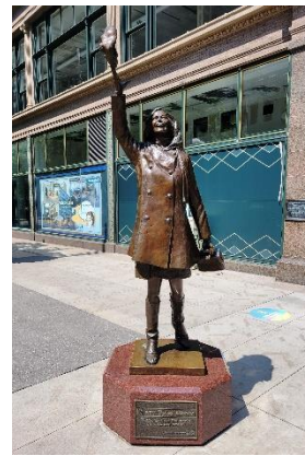
Mary Tyler Moore Statue