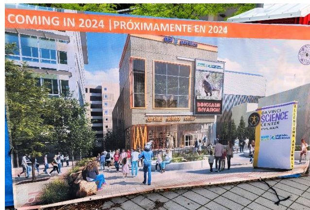
Artist's Rendition of New Center