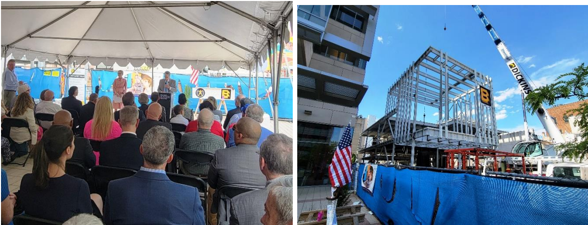
Topping- Off Ceremony