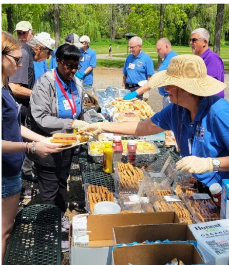
Feeding the Kids!