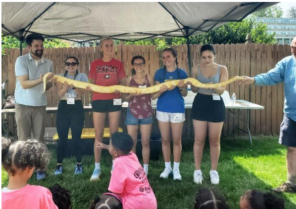
What a Snake!