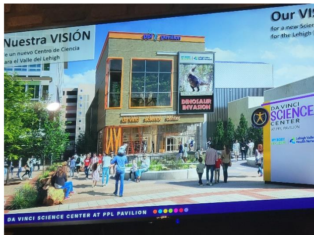
Artist Rendition of New Center

The new “DaVinci Science Center at the PPL Pavilion” is now under construction! The main entrance will be on Hamilton Street in downtown Allentown. The facility will be twice the size of the current Center and have three times the exhibit space. Alvin Butz is the construction manager. The cost of construction will be around $72 million. It is scheduled to open in Spring, 2024. Exhibits will include a Lehigh River Watershed with live river otters, a 40’ waterfall and 3 ponds! There will be a Curiosity Hall with projections up to 50 feet high. LVHN is sponsoring a “Immersive Body” on three levels, where children can