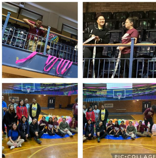
Raub Builders Club Decorating!