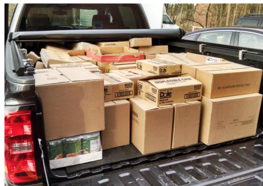
868 Items of Food Crammed into Enos' Truck