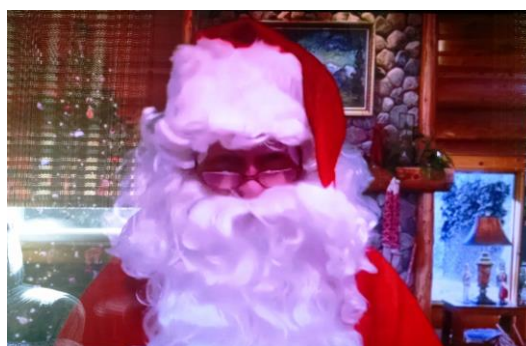
Santa From the North Pole!