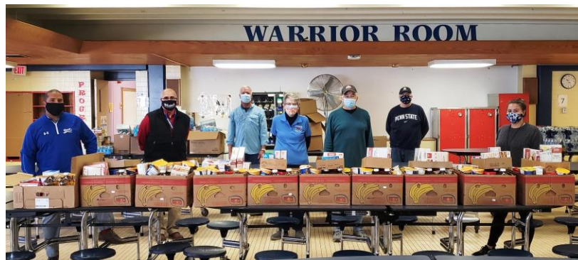
Raub Principal (L) and our Crew in Their Cafeteria