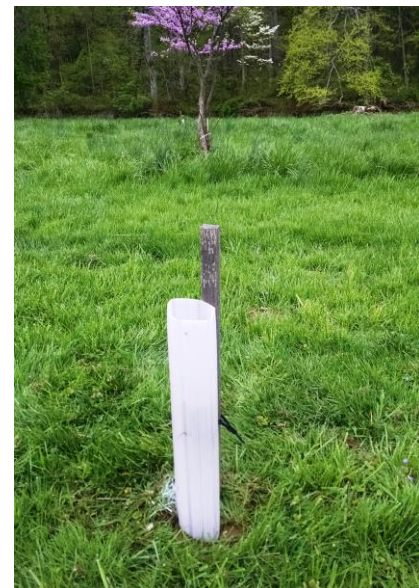
A Seedling in the Tube