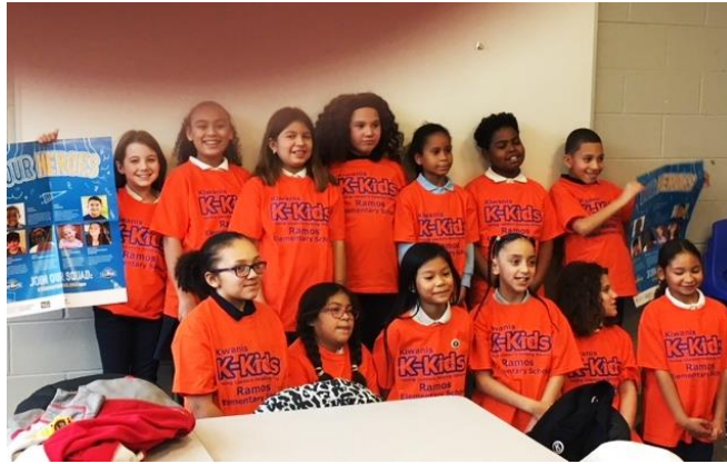
Charter Members of the Ramos K-Kids Club